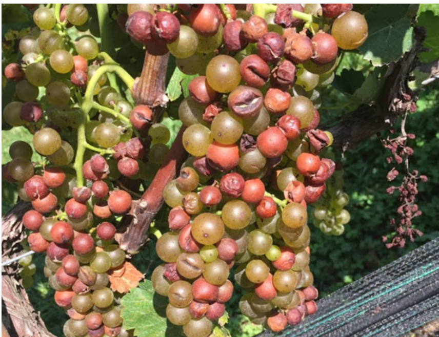
Figure 4. 'Vidal blanc' with damaged skins and sour rot symptoms.

Barata et al. (2012) has suggested that damage to berries allows sour rot to initiate. The causal agent of the damage is not relevant to sour rot, but any damage results in exploitation of the berry pulp by fruit flies, AAB, and yeast. Fruit flies are attracted to the damaged berries, and thus act as vectors that transport AAB and yeast to injury sites in unaffected fruit clusters (Barata et al. , 2012). Sour rot is then initiated through uncontrolled fermentation of the berry juice into ethanol. Ethanol is oxidized by AAB into acetic acid, which then turns the fruit shades of brown and causes the pulp to liquefy and emit a sour vinegar aroma, giving the disease its name. In fact, the smell of vinegar permeates the air and is indicative of sour rot. Damaged and rotting fruit attract more fruit flies that continue the cycle by spreading the AAB and yeast to unaffected fruit. The fermented pulp can also ooze and drip onto the other berries within the cluster, spreading the infection to previously undamaged berries. Sour rot can be visually distinctive, with deflated tan to brown berries and no obvious fungal structures (Figure 4 and Figure 5), though the disease can often coincide with Botrytis bunch rot infections (Figure 1). Sour rot can resemble sunscald, but the scent of acetic acid is a diagnostic key to identifying this disease complex.