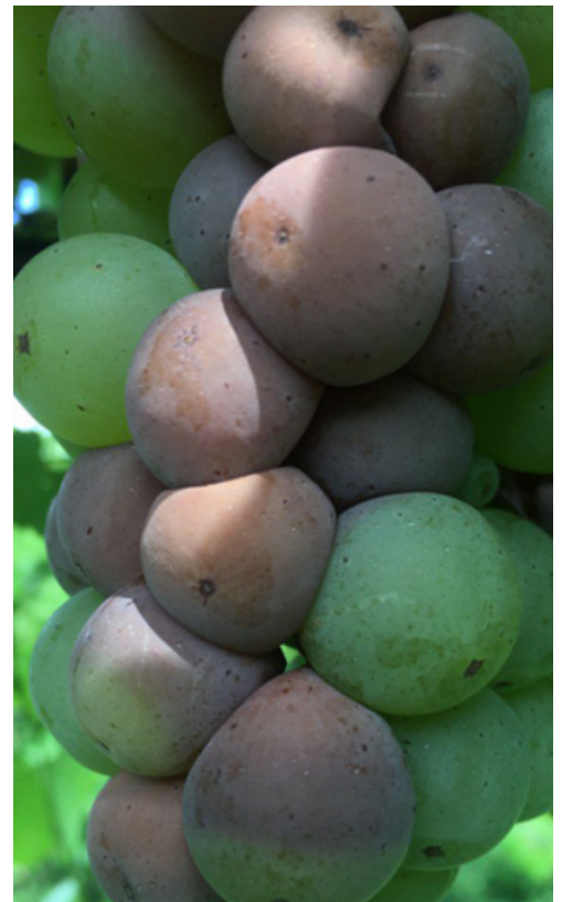
Figure 3. Sour rot infection early in ripening (~15 Brix).