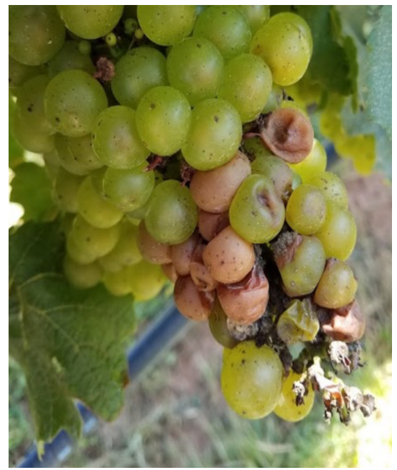
Figure 5. Sour rot symptoms on 'Chardonnay'. Sour rot can manifest as browned berries with no fungal infections (left), but the vinegar smell is diagnostic of this rot complex.