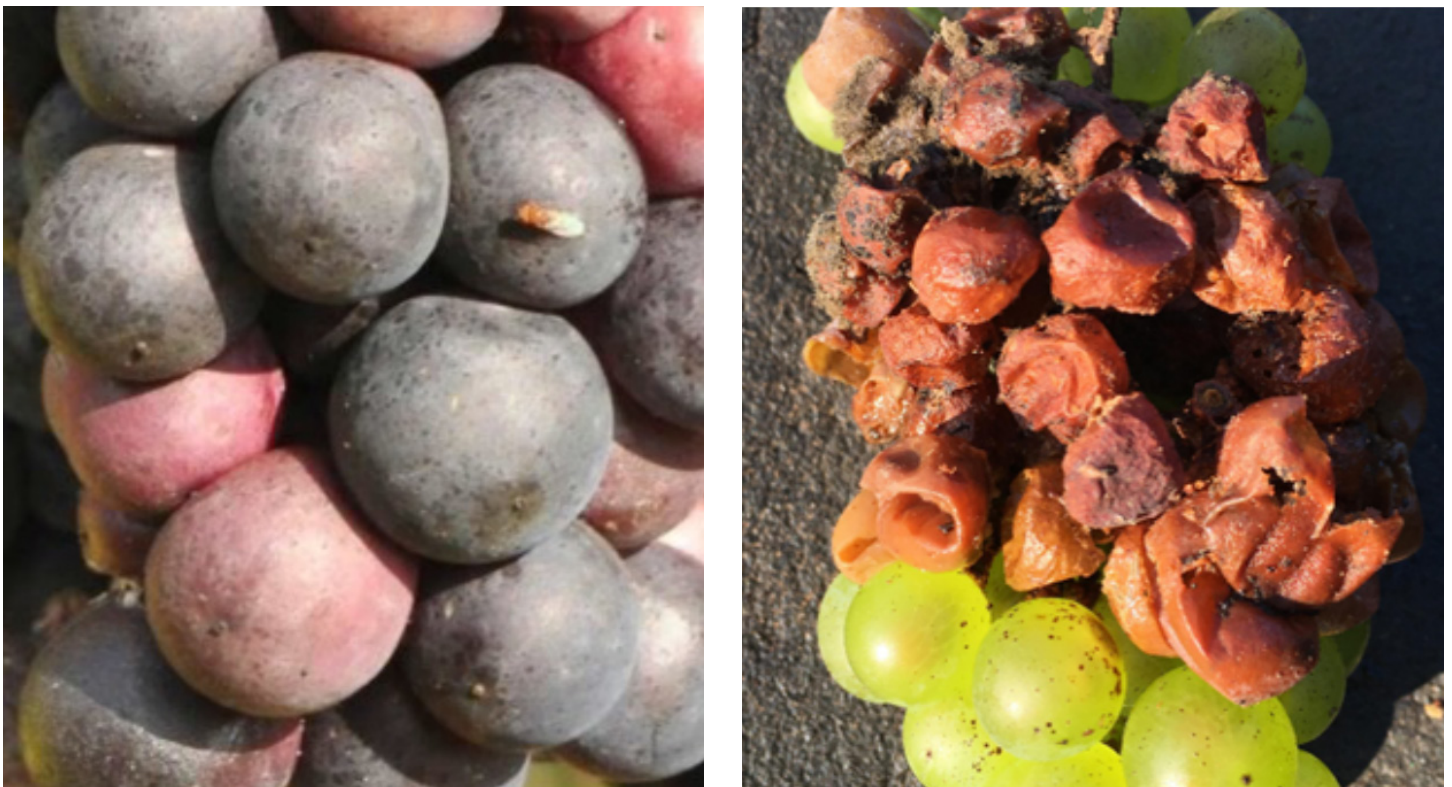
Figure 1. Drosophila species (left) and Botrytis bunch rot (right) on sour rot infected clusters. Note the fungal growth, which is not part of the sour rot complex but exacerbates the damage.

The mechanism of infection and role that multiple causal organisms play in sour rot etiology are not fully understood. However, grape sour rot has been described by Hall et al. (2018a) as a disease that only exists in the presence of damaged fruit, ethanol-producing yeast ( Metschnikowia species, Pichia species, and Saccharomyces sp.), acetic acid bacteria ( Acetobacter and Gluconobacter species) (AAB), and Drosophila species (fruit flies). Sour rot infections appear to be a function of AAB, yeast, and fruit flies on damaged grape berries that encourages disease progression throughout the entire cluster as ripening progresses. Secondary or simultaneous invasion from fungal pathogens like Botrytis cinerea can be observed in sour-rotted clusters (Figure 1).