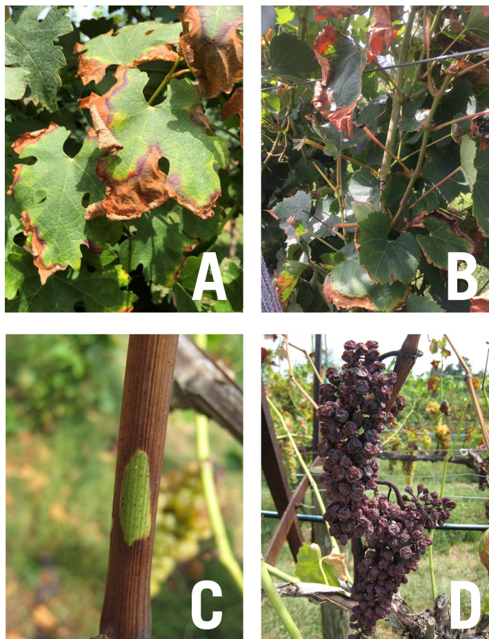
FIGURE 1. Pierce's disease symptoms include marginal leaf necrosis (A), leaf blade abscission from the attached petiole causing “match sticks” (B), “islands” of green tissue on primary grapevine shoots that are normally lignified and brown at this stage (C), and “raisins” (D).

earlier in drought years, but symptoms are generally most evident from late August through September. In grapevines, Xf causes four visual symptoms that together are strongly associated with PD. Leaf necrosis is observed on the margins of leaves (Figure 1A). Marginal leaf necrosis can be a common response to several vineyard issues; its presence alone should therefore not alarm growers. However, growers are encouraged to contact local Extension agents if the following symptoms are observed in tandem with marginal leaf necrosis. “Matchstick” is the term used to describe the symptom that occurs when only the leaf blade abscises and the petiole (leaf stem) remains attached to the shoot (Figure 1B). “Islands of green” describes the phenomenon observed when the shoot tissues harden off unevenly, resulting in green, vegetative “islands” within the brown, woody tissue (Figure 1C). As xylem flow is increasingly blocked by bacteria, infected plants will also form “raisins” as the fruit clusters dry out from lack of translocated water (Figure 1D).