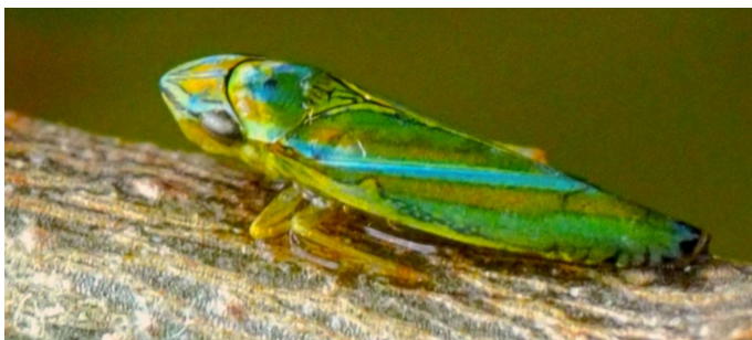
FIGURE 4. Glassy-winged sharpshooter (top) and versute sharpshooter (bottom).