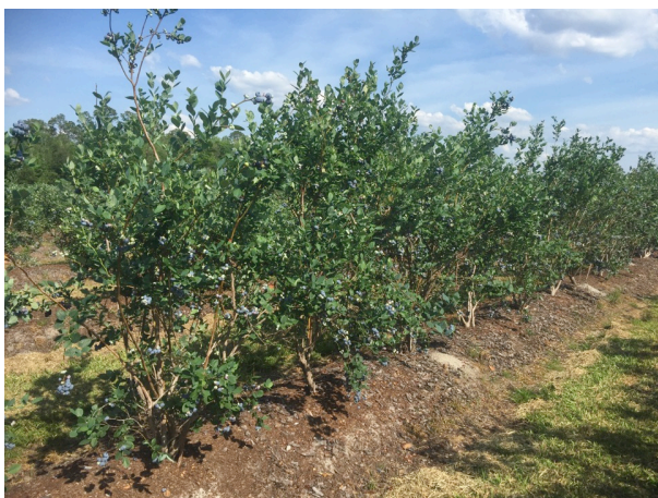
Figure 1: 'Miss Lilly™' southern highbush blueberry plants during ripening.