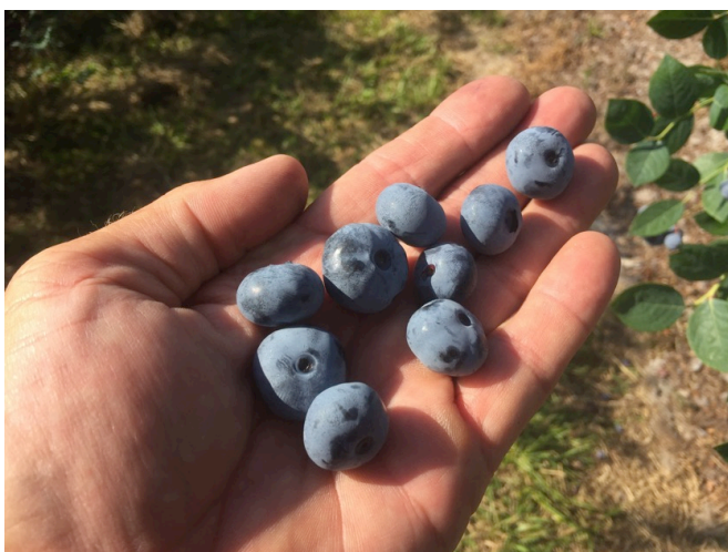
Figure 2: 'Miss Lilly™' southern highbush blueberry fruit.

'Miss Lilly™' is a strongly upright, narrow based plant, with large, high quality berries (Fig. 1 and Fig. 2). It has an estimated chill requirement of 500 to 550 hours < 45 F. The new blueberry variety is expected to offer growers fruit that ripens in the main southern