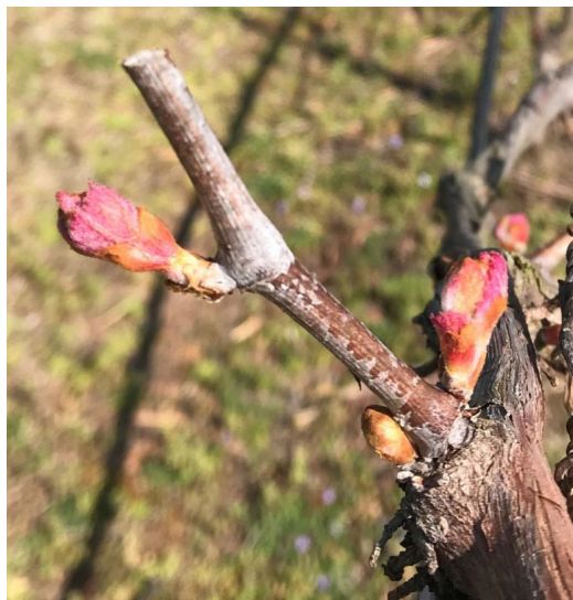
Photo: Lomanto bud break in Hall County, Georgia