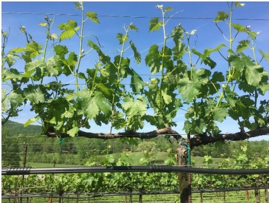
image of what this looks like (below); they can then implement in the rest of the vineyard with good precision.