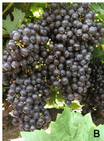
Figure 1: Ripening clusters of V. vinifera selection '502-01' within fruiting zone of a VSP trained vine at the Chilton REC, AL.