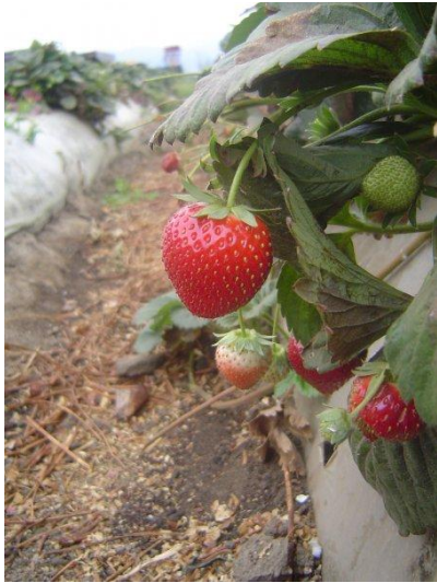
Photo: Commercial field production of strawberries.